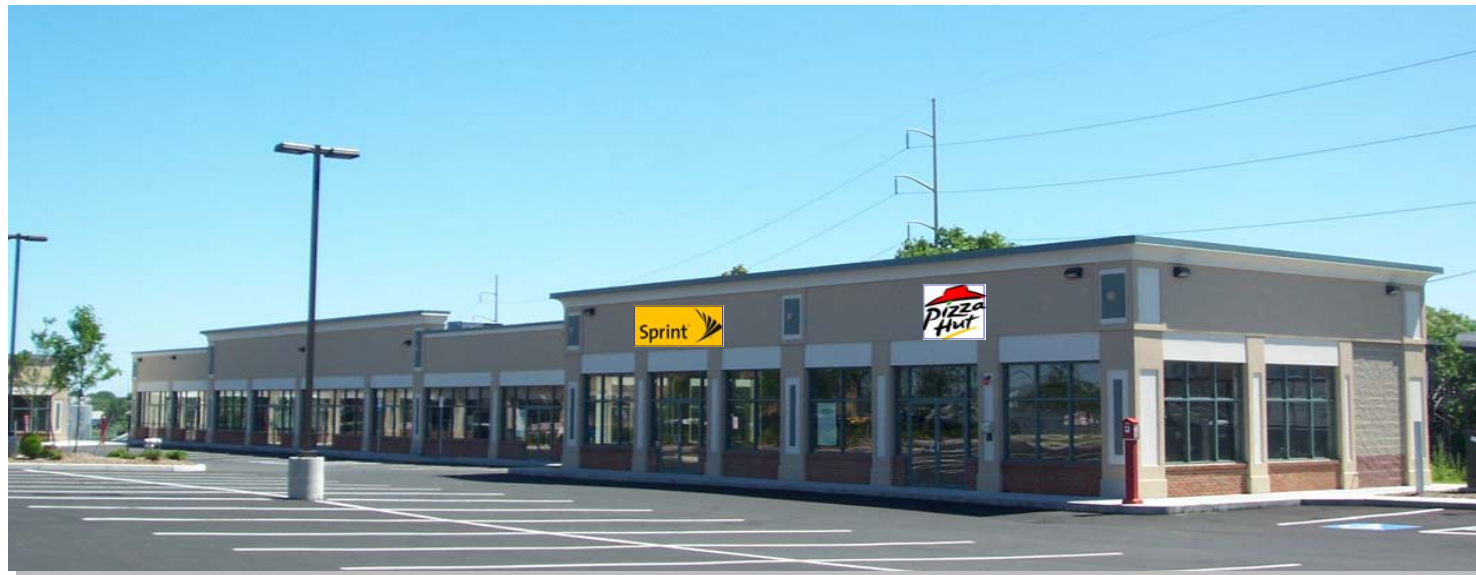
7 Everett Street - One of four retail buildings comprising Bell Circle Plaza in Revere