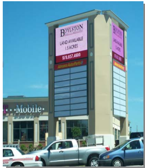
Pylon sign with electronic messaging capability measuring 14' x 9', 26' above the ground facing the bustling Bell Circle and Route 1A.